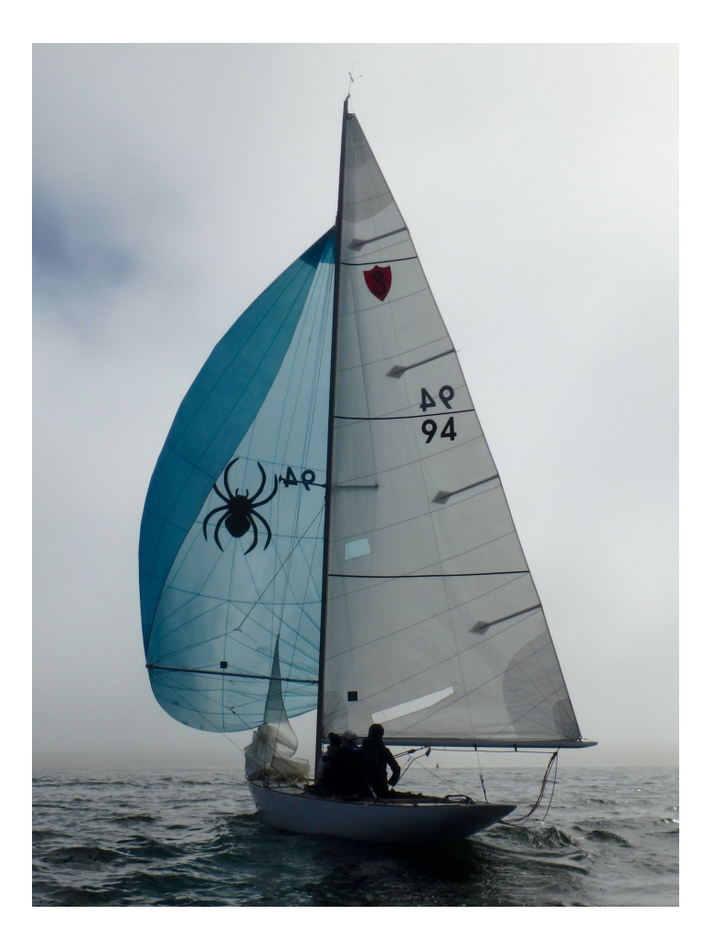
Top L-R: Charlotte #94 and Tiburon #191 with Ken Deyett Aboard. Lower: Downwind Fleet in Newport Sept 2022