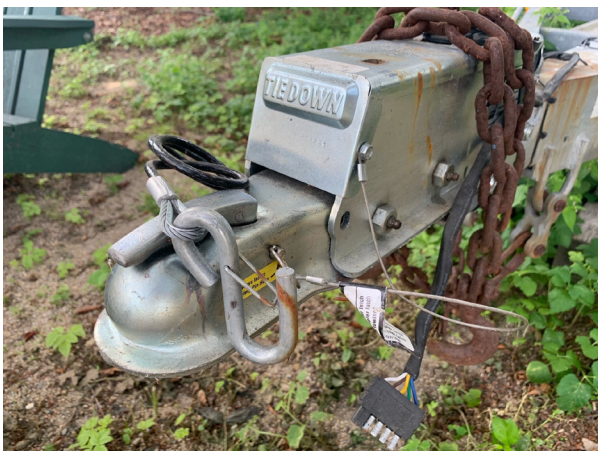
Photo Gallery CCW Starting at Upper Left: Brake Fluid Reservoir, Wheel Bearings, Hitch w/Brake Actuator, Jack Stand, Spare Tire Properly Inflated

Hopefully this was a good guide of things to look at before loading up your trailer once again. If you have any ideas for the next eMasthead, please send them my way and I'll see if I can incorporate them in the next issue.