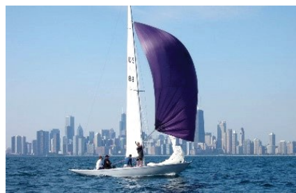
#88 Peanut on Lake Michigan