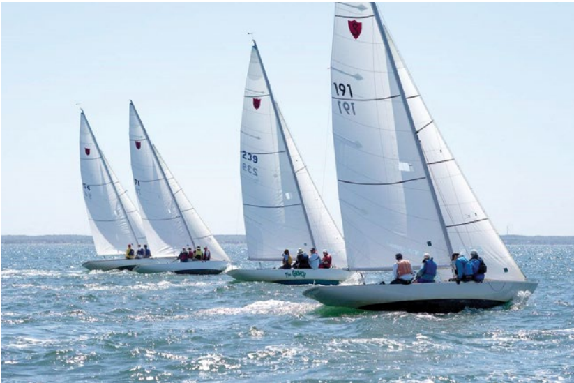
Race #1 2016 OGLC in June