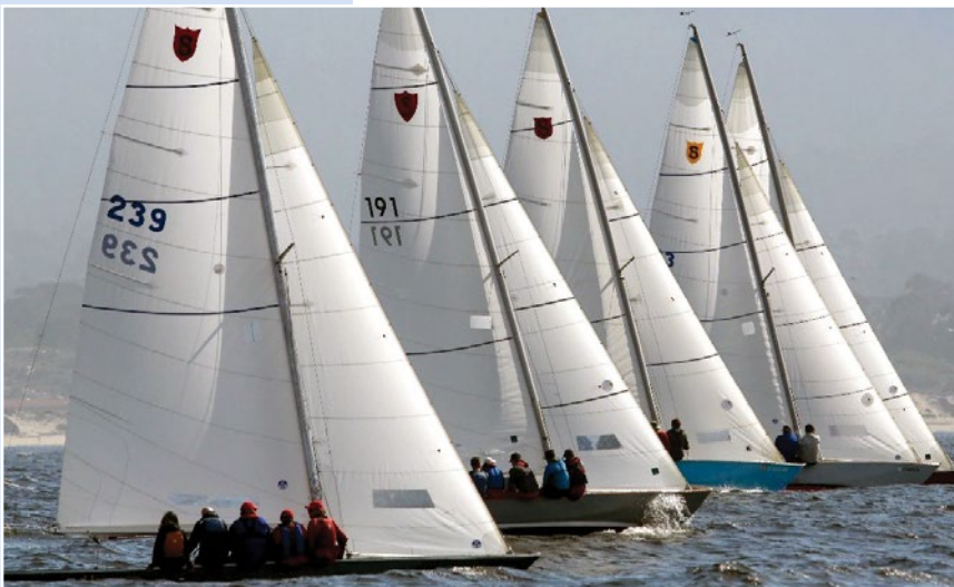
Left - Syrinx, Tiburon, Havoc, Maverick and Stillwater Right - Old Paint, Meritage, Charlotte and Sophie