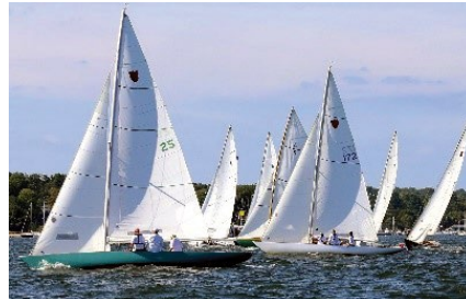
Shields at Classic Yacht Regatta

After a long postponement, a 15 kt Sou'west breeze thankfully filled in and nine classes in five divisions started on an impressive 10-mile course. This was a departure from the typical short windward-leeward courses.