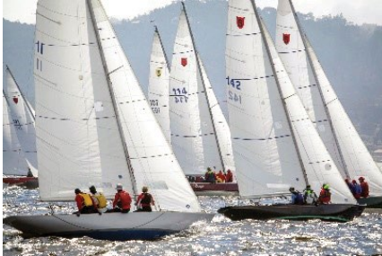
Déjà vu in Monterey