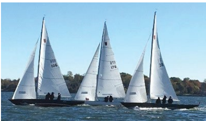
Filming of "The Tap"