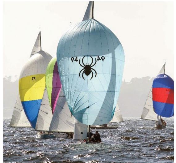
Below: Stillwater, October, Meritage