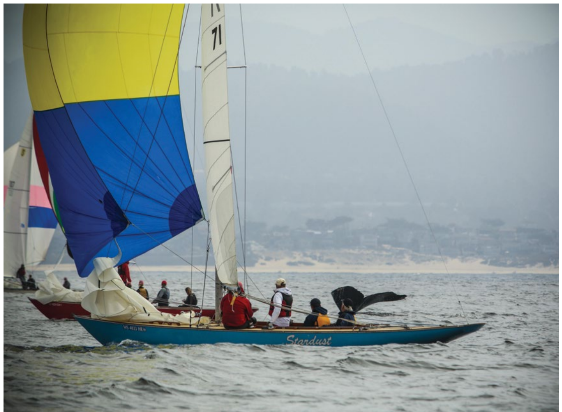
L to R: Grace 107, Stillwater 103, Old Paint 71 and Humpback Whale

The Masthead is the official publication of the Shields Class Sailing Association. Opinions expressed do not necessarily reflect views of the Shields Class Sailing Association. Acceptance of advertising does not imply endorsement or approval of the product or service advertised. Please contact the Class Secretary at pm@torridsolutions.com for information about this and future publications. Also see the class website www.shieldsclass.com for more information and to sign up for email news.