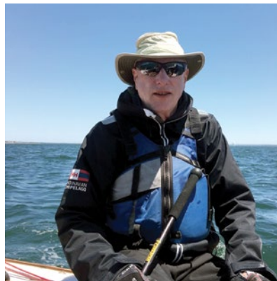
Back to Back Champ Berry

See your Fleet Captain to ensure your fleet is represented at the 2017 Challenge Cup.