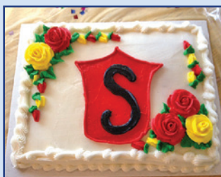
FLEETS 7 and 12