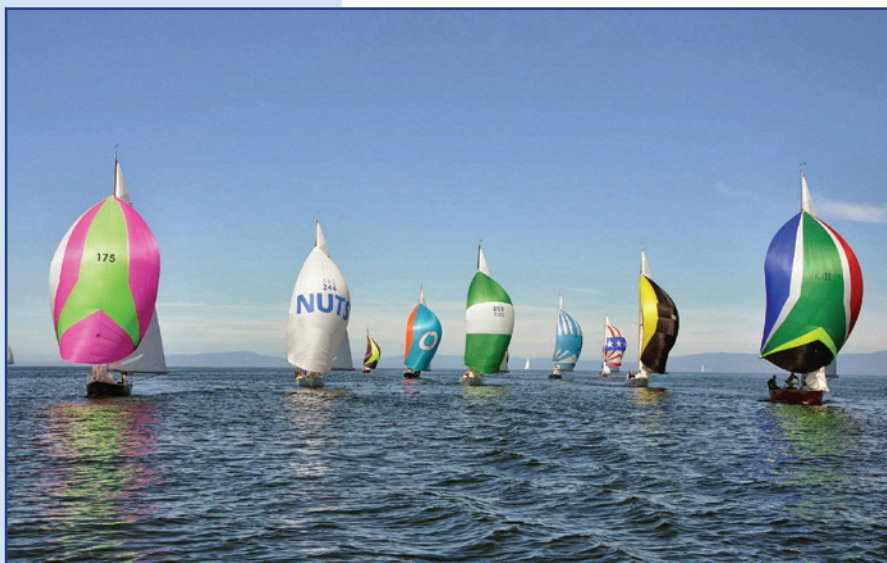
FLEETS 7 and 12:

Monterey Bay Shields fleet celebrating the 50th anniversary of the class. (Yes, we know NUTS is from the East Coast, but Ben Hall borrowed his Dad's spinnaker!)