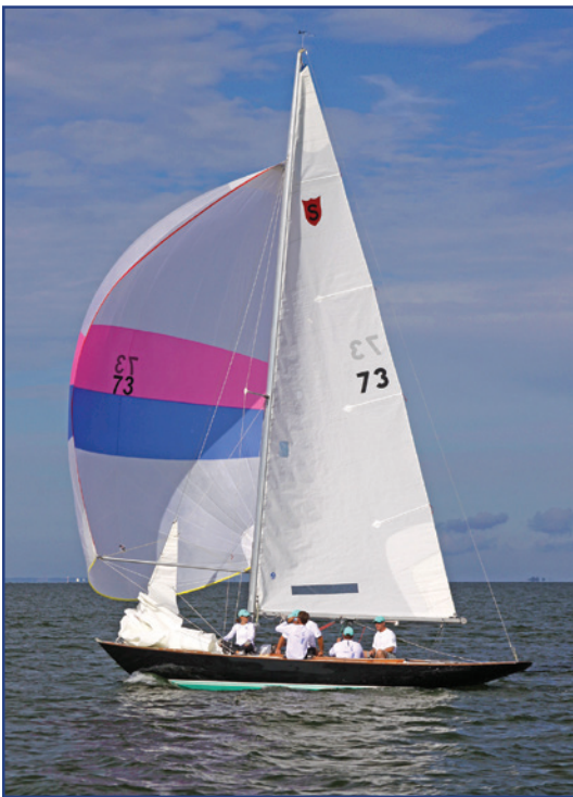
FLEET 21: Black Pearl, #73