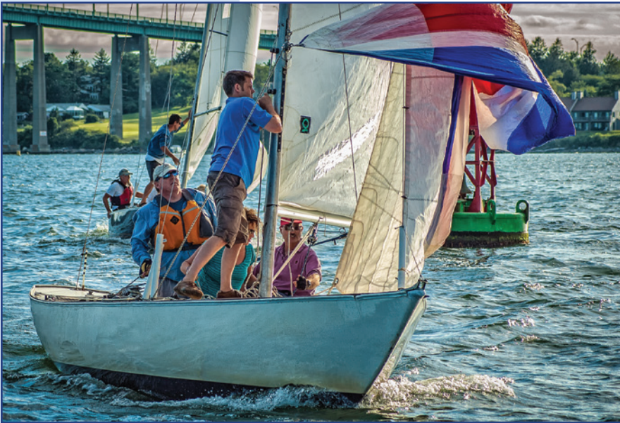
FLEET 17: Ica 15, during Wednesday Fleet 9 racing.