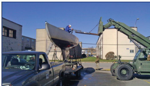
FLEET 17: Pulling boats, Navy-style. (Note the Cape Cod cradle chained on top of the flatbed trailer.)

The Navy boats didn't fare as well overall during Wednesday racing, but they did manage five top-10 finishes this season in the combined racing with Fleet 9, which is the second highest season total over the past 10 years. Our challenge this offseason will be convincing the Navy they can afford to purchase sails for the boats, as they haven't done so for the past two