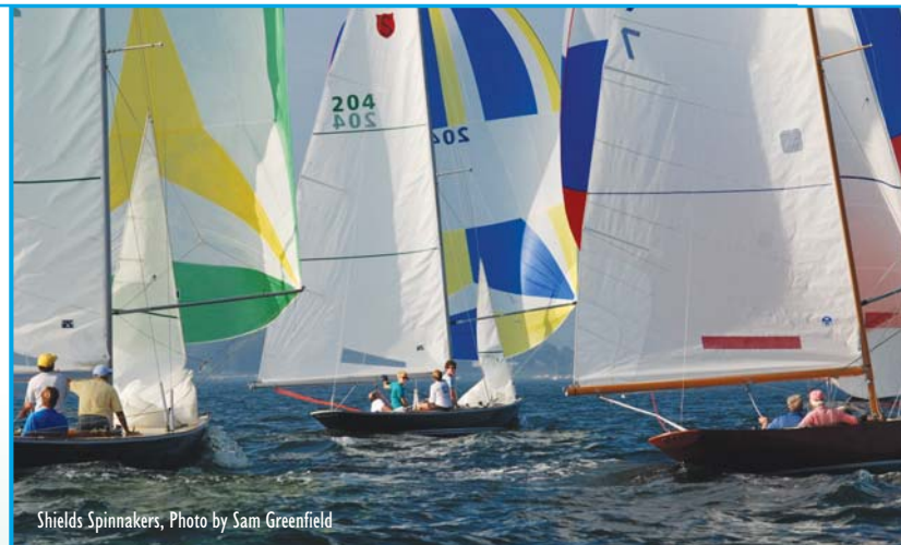
Shields Spinnakers