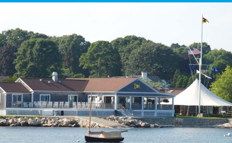
MIYC Clubhouse, Photo by Shirley Wick

The Masons Island YC promises tightly run racing offshore with open doors onshore. Competitors and their families will be greeted with many options for fun, food and water on our beautiful shores. The view from the club deck offers the open Atlantic with Block Island 20 miles out, Watch Hill, RI to the left and Fishers Island to the right. Sister clubs and neighborly marinas have teamed with us to make certain this will be a Nationals Regatta and your September travel destination to remember. We look forward to meeting you!