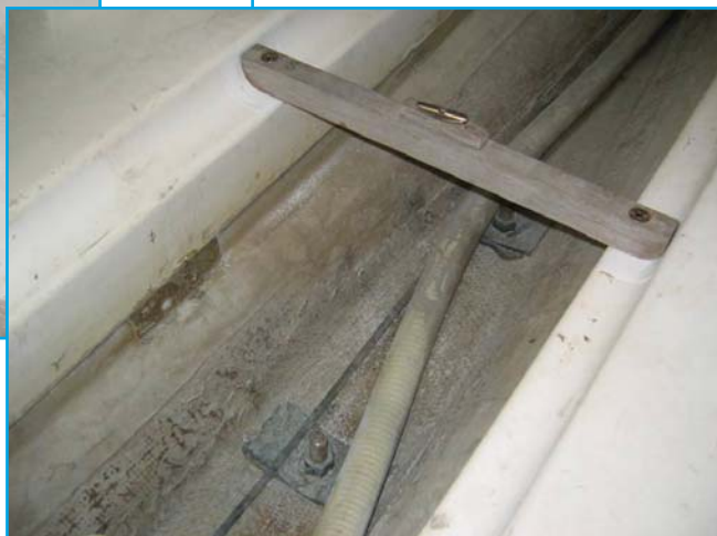
The floorboard crosspiece. These 2 fastenings over time need maintenance.