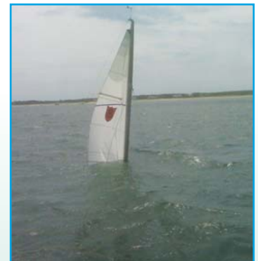
Bill Berry realizing Shields don't make good submarines.