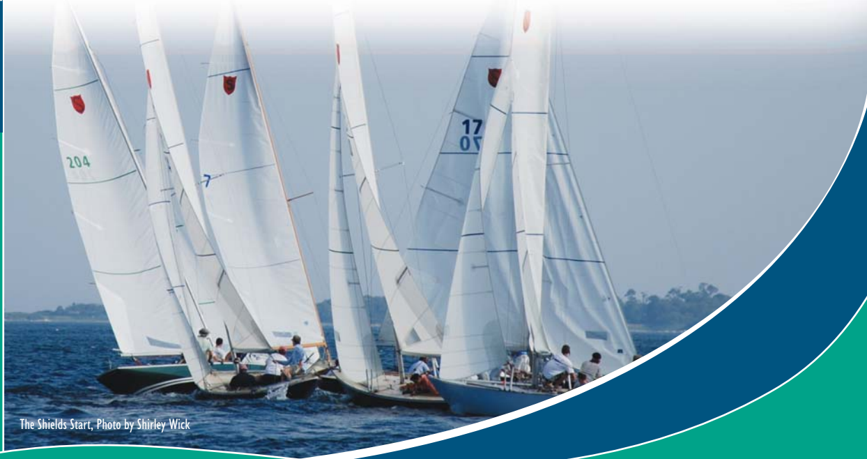
The Shields Start

ADDRESS: 83 GRIFFIN AVENUE, SCARSDALE, NY 10583