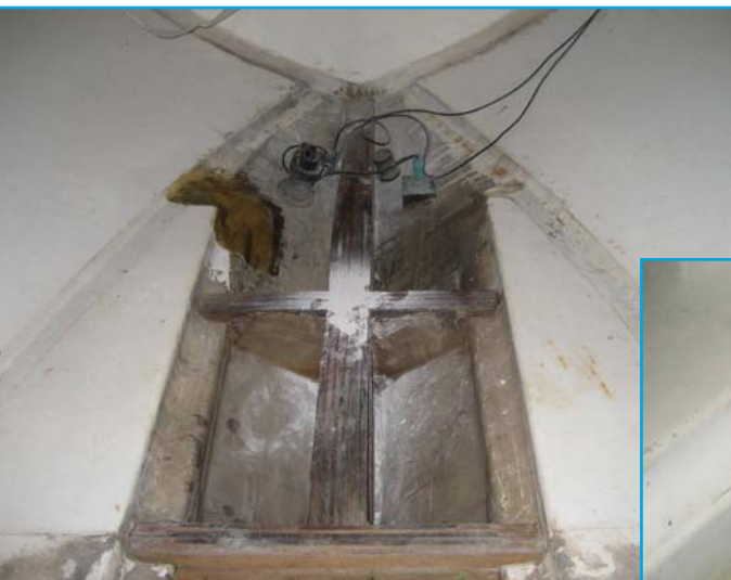
View of the floor air tanks after the floorboards were removed.

it floating, they must take up the same amount of space as the 4 existing air tanks. Repairing damaged air tanks as opposed to modifying with air bags or foam is the only permanent solution. An air bag can be punctured by a toerail screw and foam will saturate when wet. Once you have