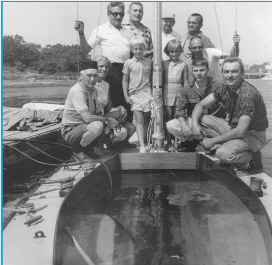
Black Pearl on the bottom of the Choptank, October 10, 2009. (See http://www.shieldsclass.com/measurer/blackpearl.pdf for full discussion)

The Shields Technical Committee has been working on issues that would facilitate the “self rescue” of a Shields yacht. The sinkings that the committee is aware of (two in 2009) occurred during spinnaker runs. The safe handling of a Shields spinnaker in high winds or seas is left to another discussion; this discussion will be concerned with the outfitting and preparation of the yacht and conformance with Class Rules to facilitate “self-rescue”.